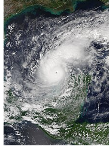
Hurricane Milton makes landfall near Sarasota October 9, 2024.

The ELC, through the Florida Division of Early Learning assisted preschools in need by easing protocols and helping to navigate regulations so that schools could reopen as soon as possible.